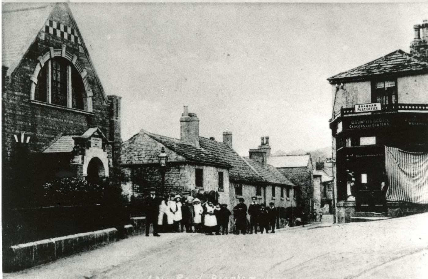
Low Road, Bramham

The Village School (above) see book pages 32-5 Below are Methodist Sunday School children.